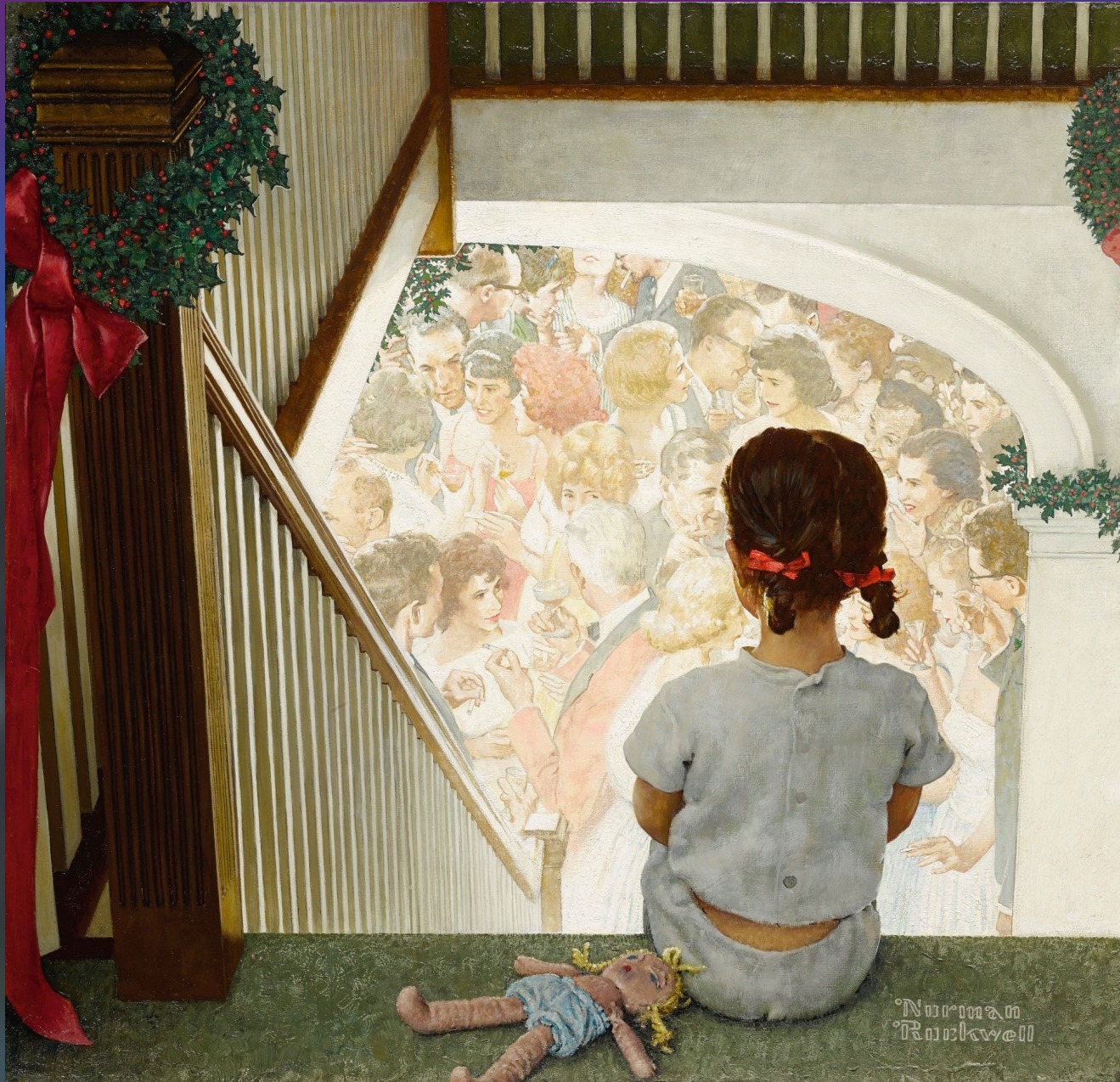
The Christmas Party Norman Rockwell 1964