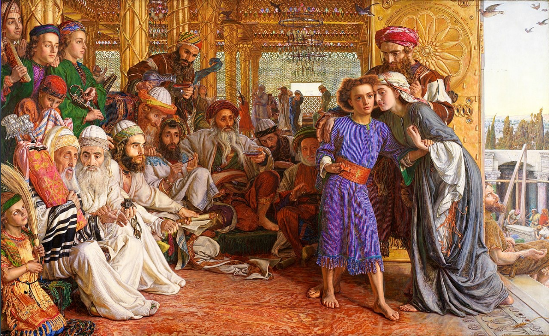
The Saviour in the Temple William Hunt 1860