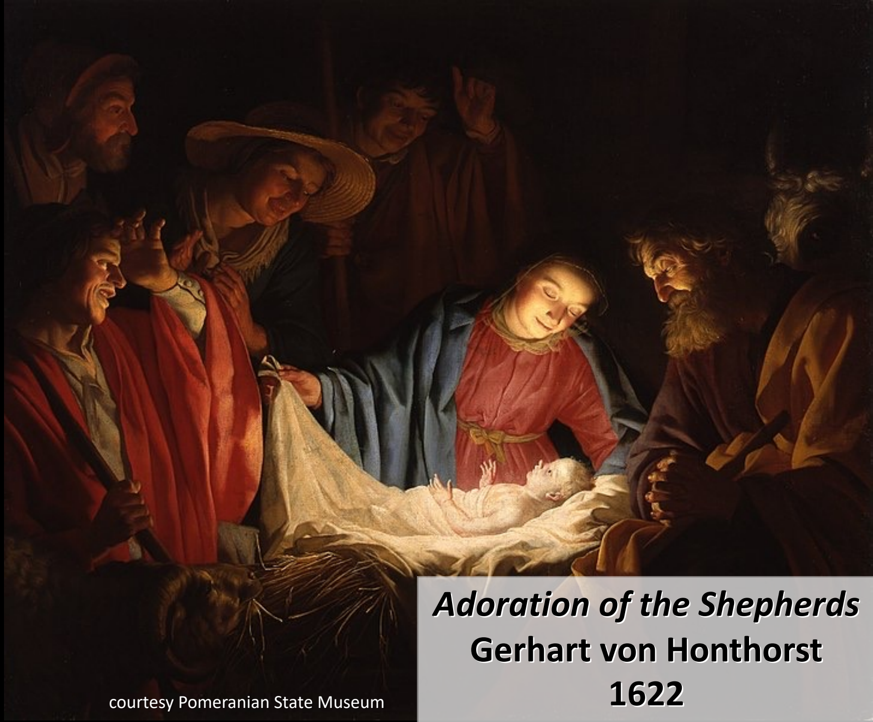
Adoration of the Shepherds Gerhart von Honthorst 1622