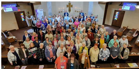
Lutheran Women's Missionary Society Milwaukee Metro North Spring Rally 2024 Attendees Pilgrim Lutheran, Menomonee Falls