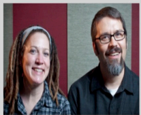
Worship with Tangled Blue