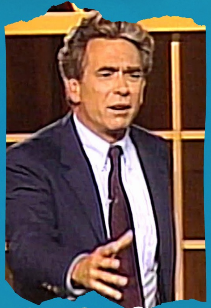
Dr. R.C. Sproul

“ No longer our ruler, the world still appeals to our remaining sin, so we must maintain our guard lest we fall back into bondage. ”