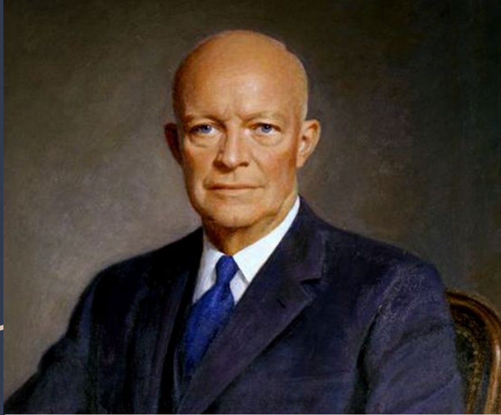
Dwight D. Eisenhower U.S. 34th President

“In the highest sense the Bible is to us the unique repository of eternal spiritual truths.”