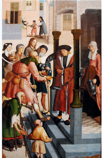
In this 1504 painting, Giving Drink to the Thirsty , artist Cornelis Buys the Elder depicts a man and his wife giving out water to those that are thirsty. Standing in the crowd of those waiting is Jesus.

Why does Paul say that the Old Testament was written for us? How should this shape how we encounter Old Testament stories and teachings?