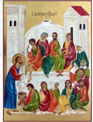
Jesus washing His disciples' feet

Spend a moment reflecting on Jesus' salvation as water being poured out upon you. Then pick any favorite worship song/hymn and sing it (either acapella or accompanied with a YouTube video or music app).