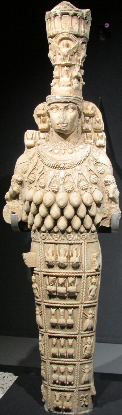
BÜYÜK ARTEMİS HEYKELİ GREAT ARTEMIS STATUE MS 1. yüzyıl 1st century AD