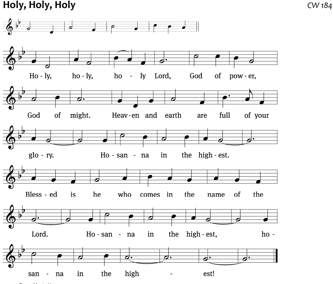
Tune: Marty Haugen

among us as a human being and revealed his glory as your only Son, full of grace and truth. Therefore, with all the saints on earth and hosts of heaven, we praise your holy name and join their glorious song: