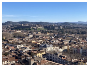
Cité seen from belfry