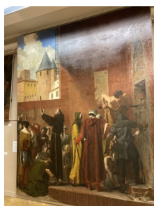
Les emmurés de Carcassonne

Back in the 12 th century there was a movement within the Catholic Church in the Carcassonne area. Fervent believers had come to understand that the Scriptures say to commemorate the Lord's sacrifice each time they ate bread or drank wine. That meant every meal. With time, their practice developed into a regular little ceremony; the oldest person sitting at the table would lift a loaf of bread over their left shoulder and recite a few sentences, etc. The priest was left out of this, so, although these people continued to faithfully attend church services, the clergy called them heretics and came down hard on them. The actual room where trials were held and its passage to the prison and archives towers are off limits to tourists, however one of the main attractions of Carcassonne is the Museum of the Inquisition that displays a collection of torture machines invented by the clergy to use on these people. This movement that was given the name of "Cathars" took on another particularity; they claimed they could trace the transmission of the Holy Spirit by the laying-on-of-hands all the way back to the apostles. This made their situation worse, because the only way to stop the movement was to prevent them from passing it on by touching another person which brought the clergy to wall them up or to order their immediate death. One famous motto came from a priest who wasn't sure who was who, so just in case ordered to "Kill them all; God will sort them out."