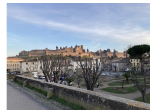
Cité later in the day

The train going 150 miles to Carcassonne was exceptionally only one euro...Alain was absorbed by different projects in his office, so I decided to go by myself and stroll around the famous citadel. I was game to do things I'd never done before like walk the Canal du Midi from one lock to another and climb the 232 stairs of the Saint Vincent belfry to enjoy a view of the Cité from a mile away. What made it even better was to discover that entrances to the restored castle and its battlements were free that day, as well as the Art Museum downtown. Sounded like all fun. Then again, Carcassonne is more than just a cool setting for the film Robin Hood: Prince of Thieves ; it's a reminder of some historical tragedies.