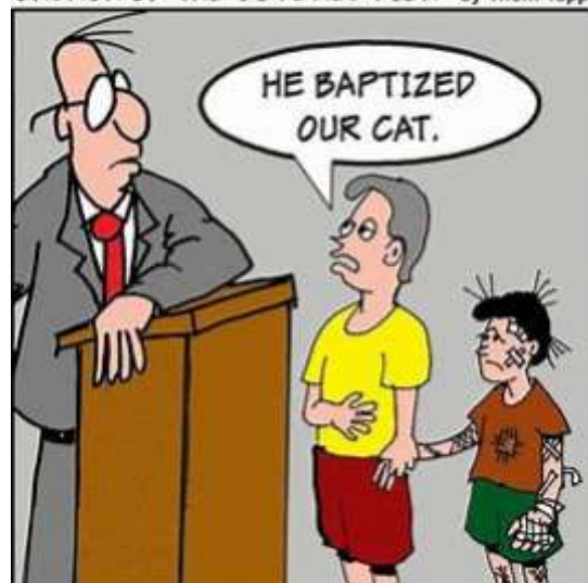
CHURCH OF THE COVERED DISH by Thom Tapp

"Sayin' 'Amen' is like pressing the 'SEND' button for your prayers."