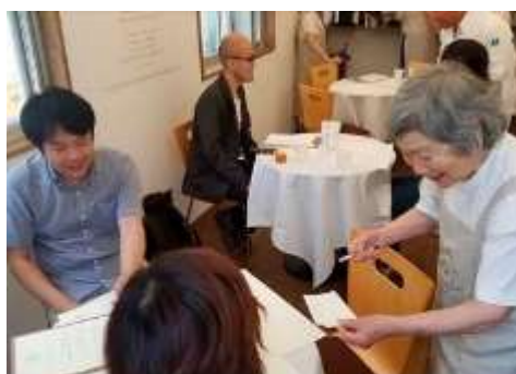
'The Restaurant Of Order Mistakes' employs waiters with dementia, and you never know what you're getting.