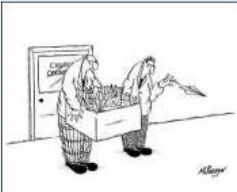
"Remind me never to ask the Youth Group to help fold the church bulletins again."