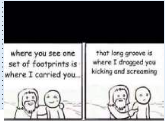
where you see one set of footprints is where I carried you...