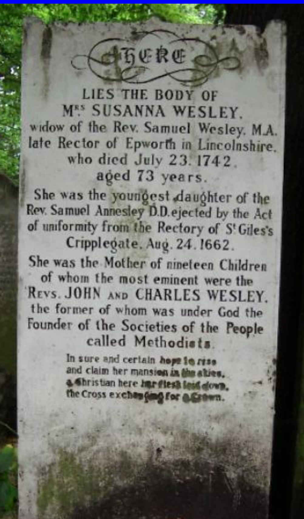
Susanna Wesley's tombstone