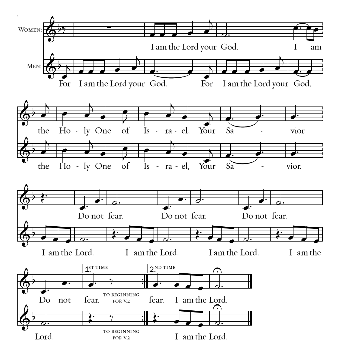
(Words: Biblical text, Music: unknown, CCLI license #2476739)