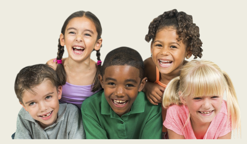
Read Romans 3:1-22 this week.