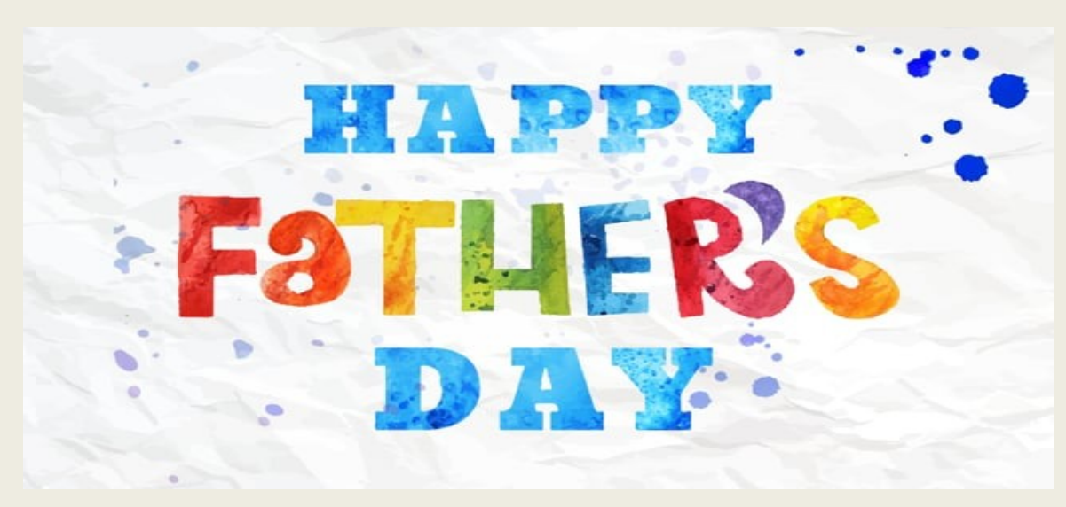
Read 1 Kings 20:35-43 this week.