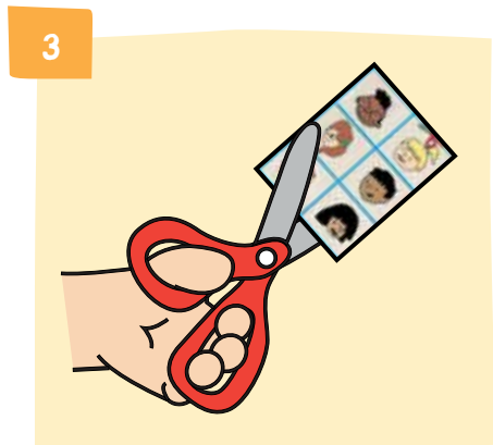
Choose one of the markers, and cut it out.