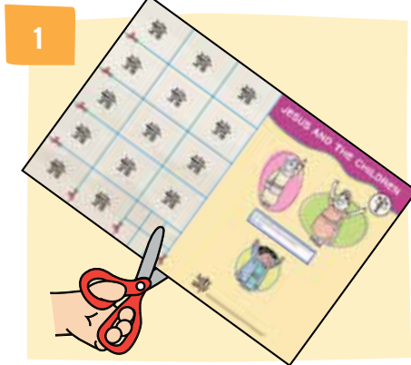
Cut the leaflet in half.

FUNNY KIDS GAME: Kids make and play a board game using funny actions to get everyone closer to Jesus.