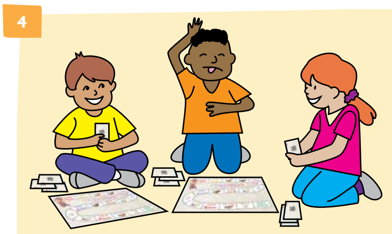
Roll a die and move your marker on the game board.