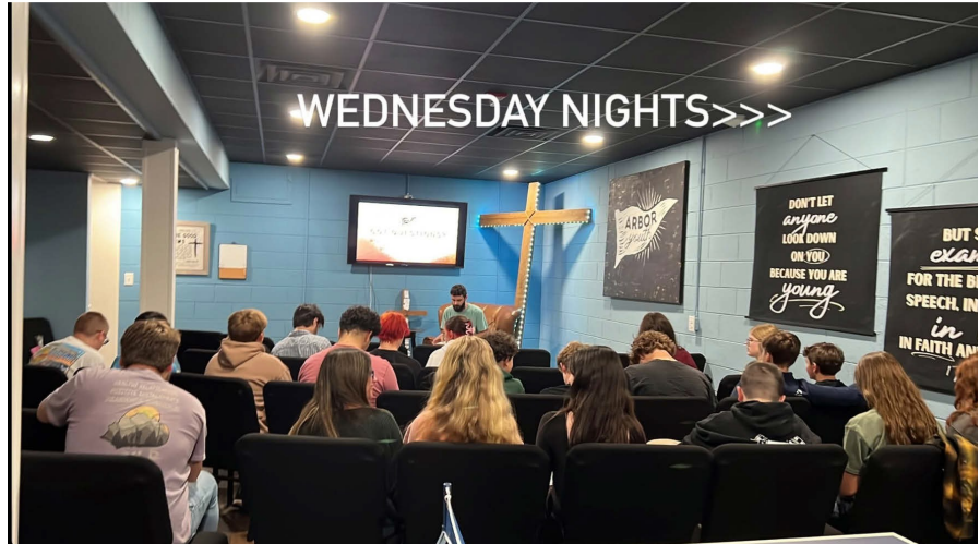
Our ARBOR YOUTH class on a Wednesday Night!