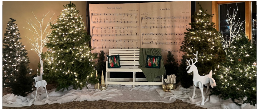
Photo Opportunity in the Fellowship Hall

Friday, December 1, at 6:00 Fun for all ages. Mom, Dad, Grandma, Grandpa, Kids, Friends, Everyone! Pizza provided. You are welcome to bring extra games and snacks.