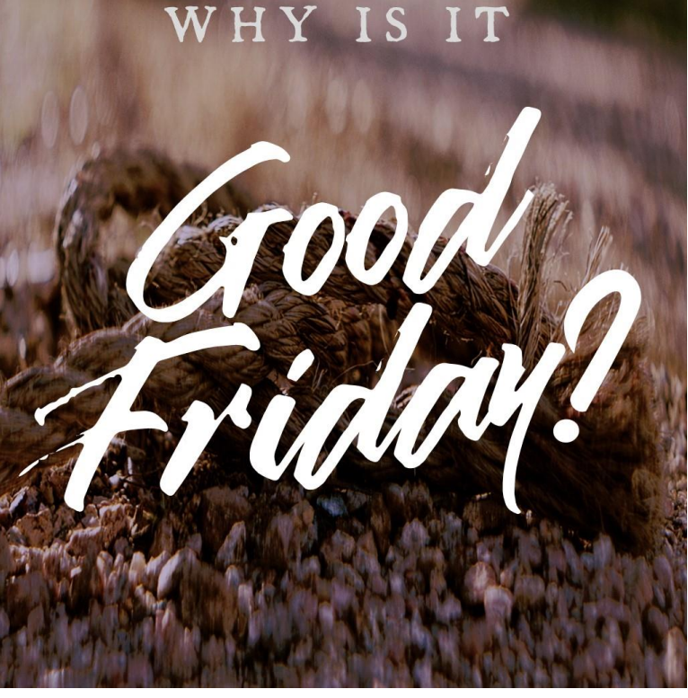
March 29, 2024