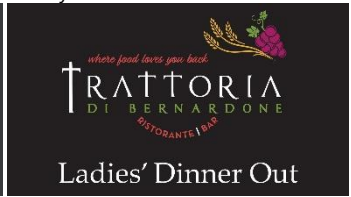
Sept 27 at 6:00 PM Contact Bessie Lambert