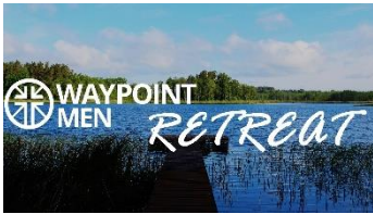
Men's Retreat October 20-21, Starke, FL