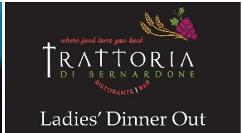
Sept 27 at 6:00 PM Contact Bessie Lambert