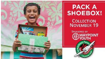
Operation Christmas Child Collection date November 19