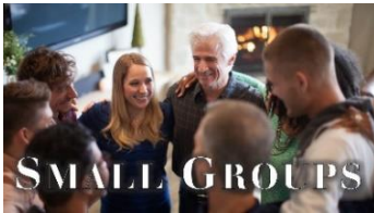
Multiple groups are available. Contact Pastor James to get connected