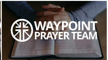
Every Friday at 8:00 AM via Zoom meeting