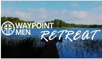
Men's Retreat October 20-21, Starke, FL