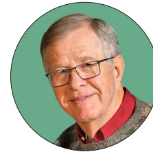
David Letterman Jan. 5