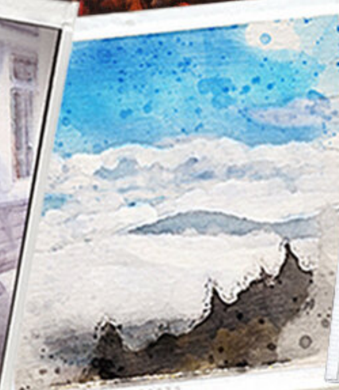
SOO PRETTY!! 1/30