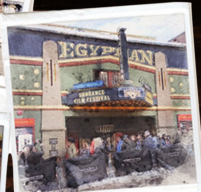
THE QUEUE!! 1/29