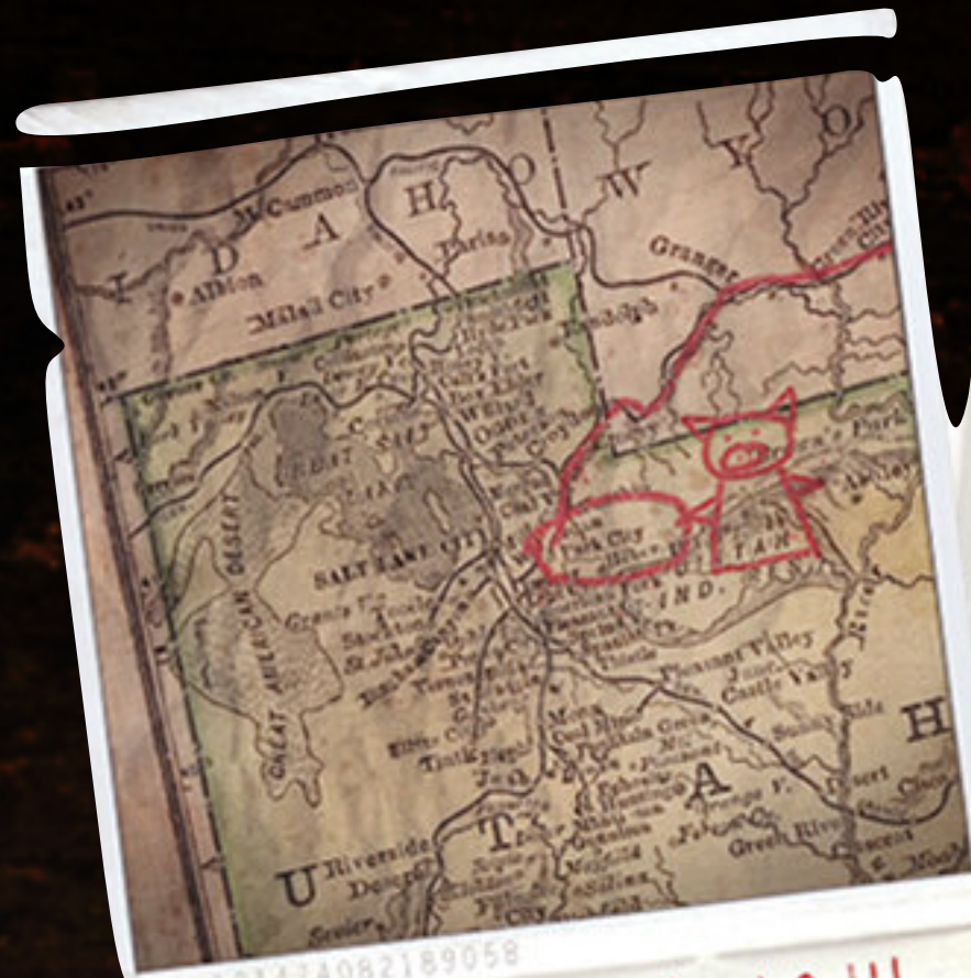
WE ARE GOING!!! 1/26