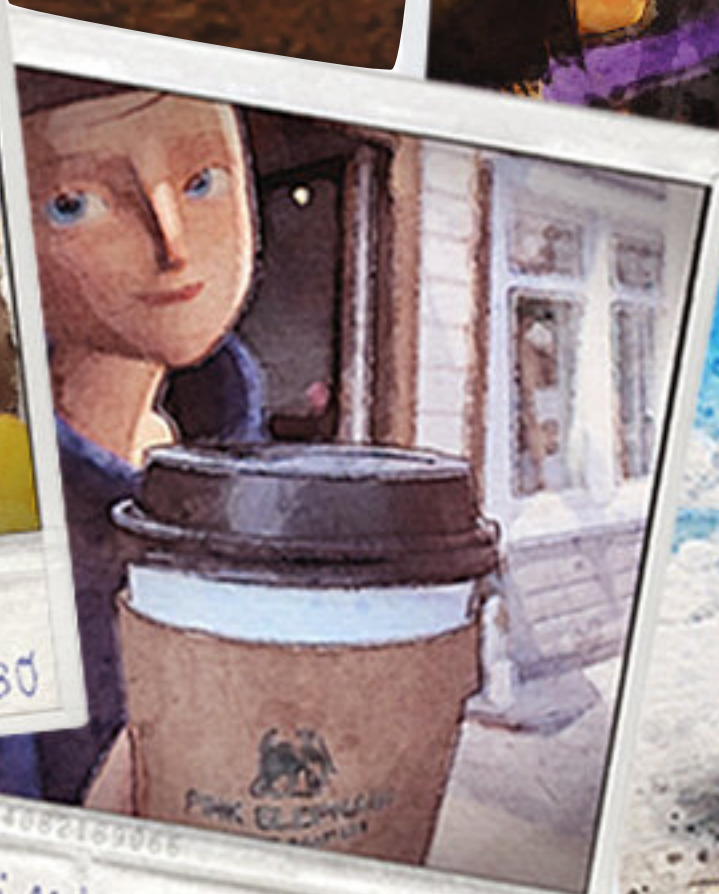
MOM'S FAVORITE 1/30