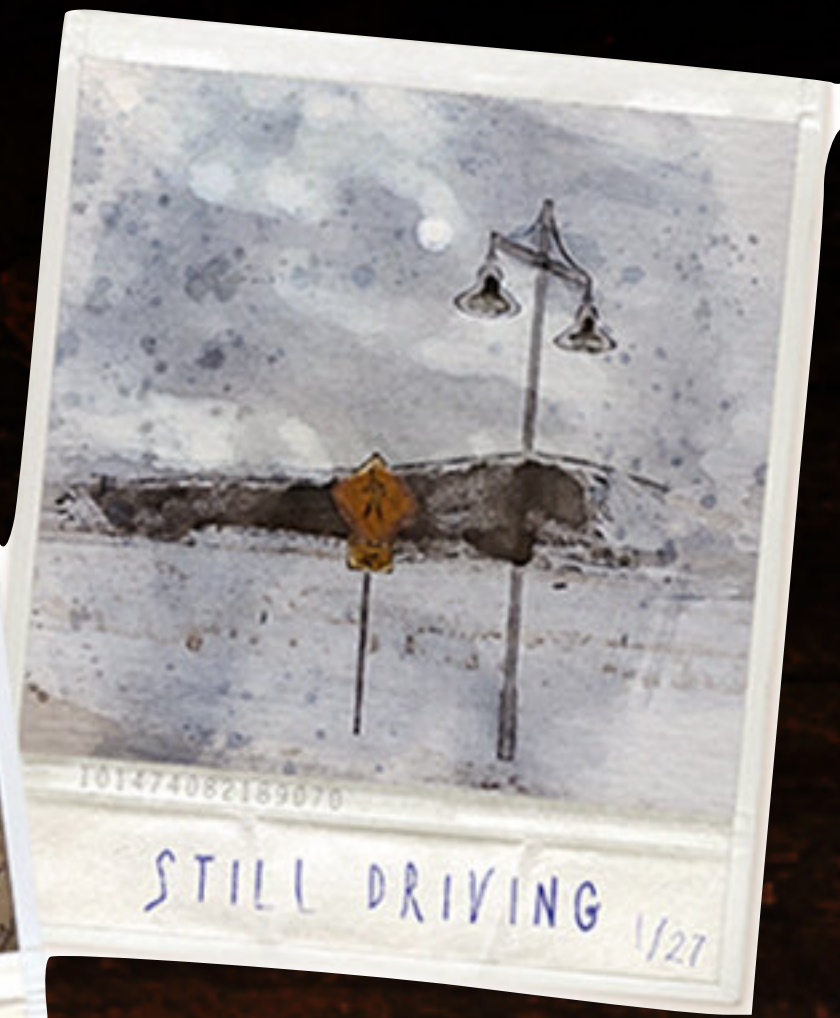
STILL DRIVING 1/27