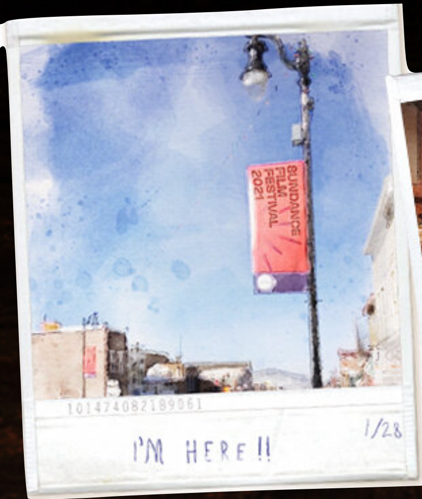
I'M HERE!! 1/28