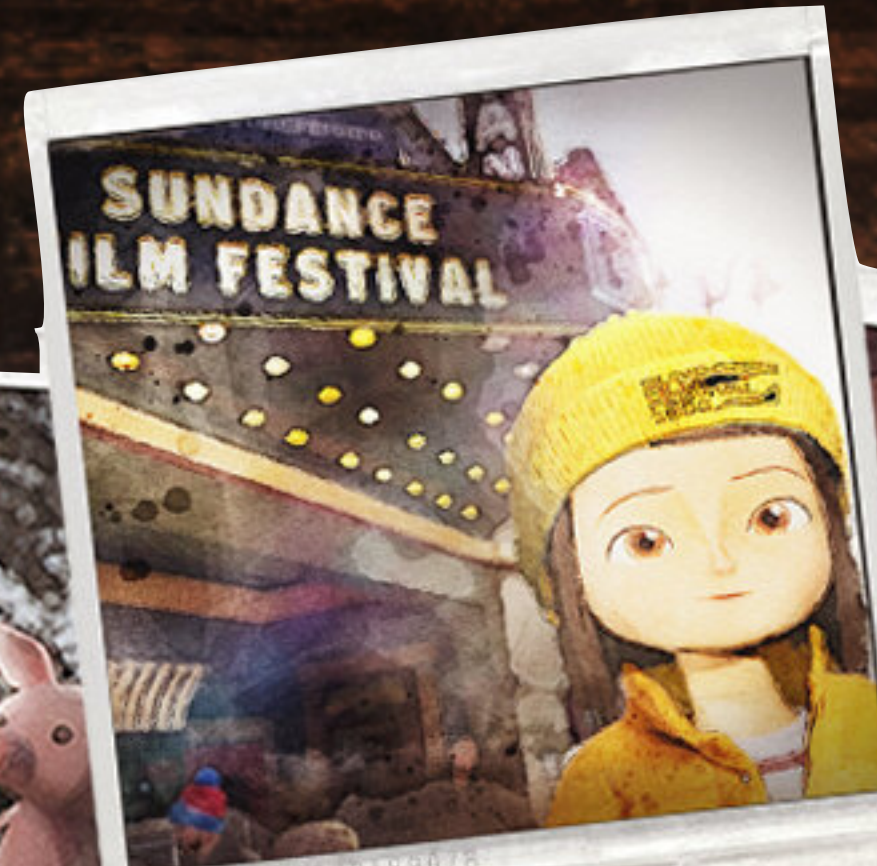
SHOW TIME 1/30