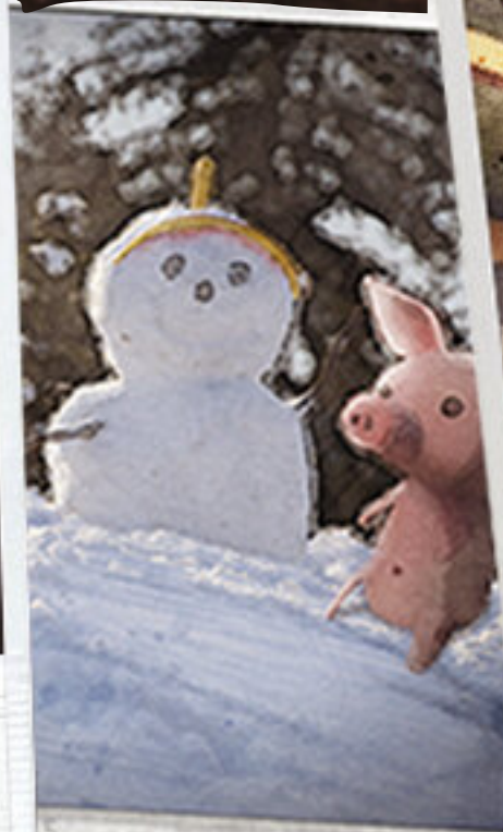
SNOWMAN & PIG 1/31