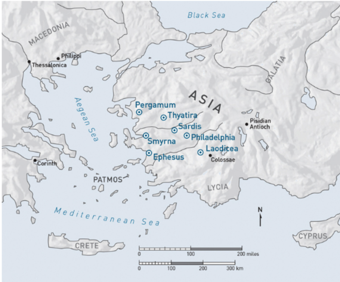
The Island of Patmos and the Seven Churches of Western Asia Minor (Modern Turkey)