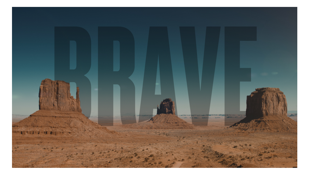
Small Group Study Questions