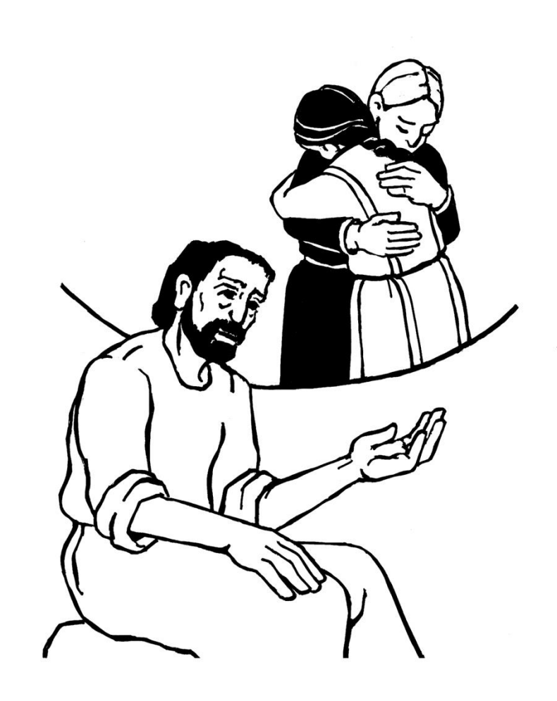
6th SUNDAY AFTER EPIPHANY

Sunday, February 12th, 2023 * 9 AM * INPERSON and ONLINE