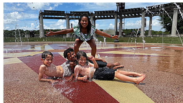
Cousin Time At Splashpad