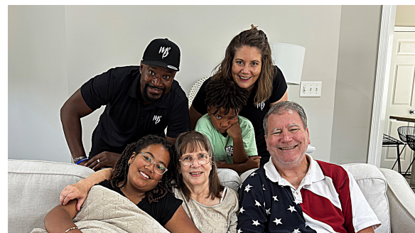
A Great Time With Nana & Papa