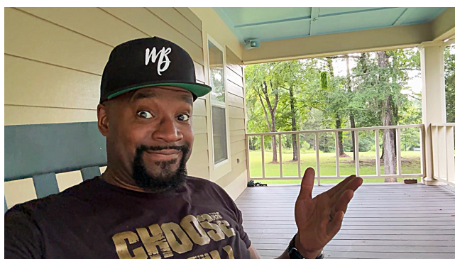
Enjoying some time on the porch