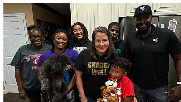
Hanging With The Browns