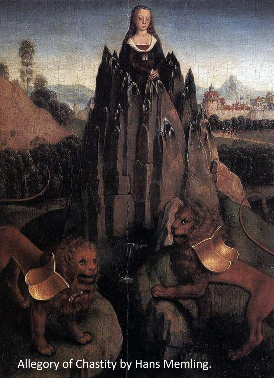
Allegory of Chastity by Hans Memling.