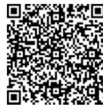
RFCCD Summer Enrichment

The Mary Alice Hawthorne Ware Scholarship is seeking the following: 1) high school graduates that will pursue their education at a two-year technical, community college, four-year public, private college, or university 2) students currently enrolled in a two-year technical, community college, four-year public, private college, or university. Scholarship applications and guidelines are available at: https://forms.gle/3QZfCF8hQ5fc7Mox7 . Scan QR code below.