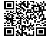
College QR Code