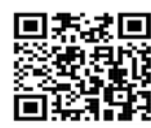
High School QR Code