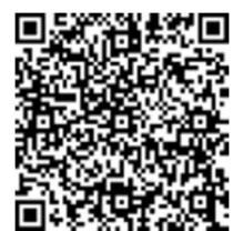
RFCCD Summer Enrichment

The Mary Alice Hawthorne Ware Scholarship is seeking the following: 1) high school graduates that will pursue their education at a two-year technical, community college, four-year public, private college, or university 2) students currently enrolled in a two-year technical, community college, four-year public, private college, or university. Scholarship applications and guidelines are available at: https://forms.gle/3QZfCF8hQ5fc7Mox7 . Scan QR code below.