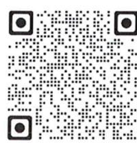
High School Application