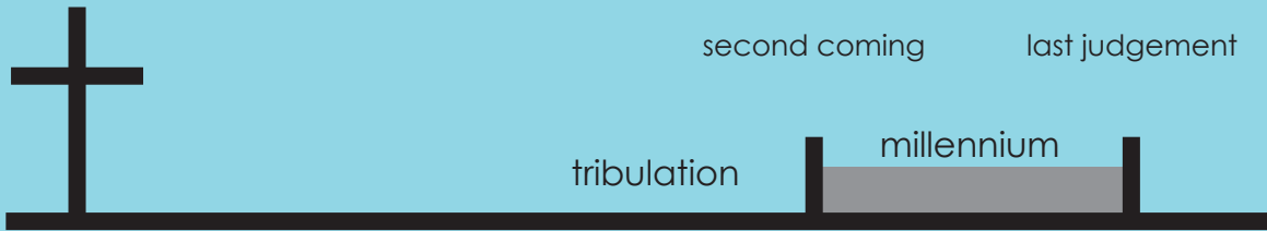
1. Post-tribulational Premillennialism