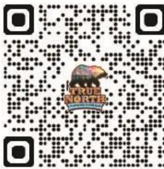
True North VBS Meal Sign Up