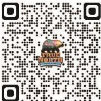
True North VBS Supply Registry

We are starting to prep for the 2026 VBS True North. We are looking for volunteers, some supplies and help with meals in order to make this year's event an unforgettable one. Please scan the appropriate QR code below or see the bulletin board to the east of the Sanctuary to help bring True North to life with us!