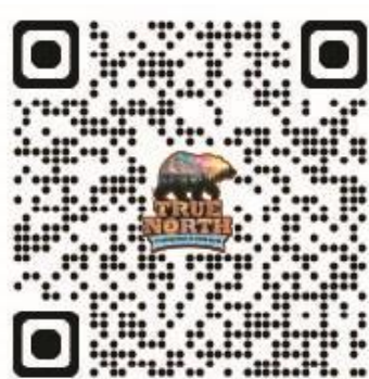
True North VBS Volunteer Registry