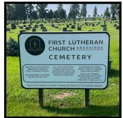
The new sign at the east entry featuring the new FLC logo and some new rules