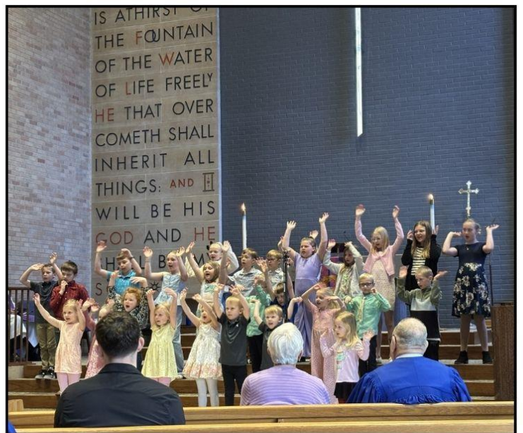
Left: The Journey students entertain with their Christmas program in December Right: the Journey students blessed us with special music on Palm Sunday