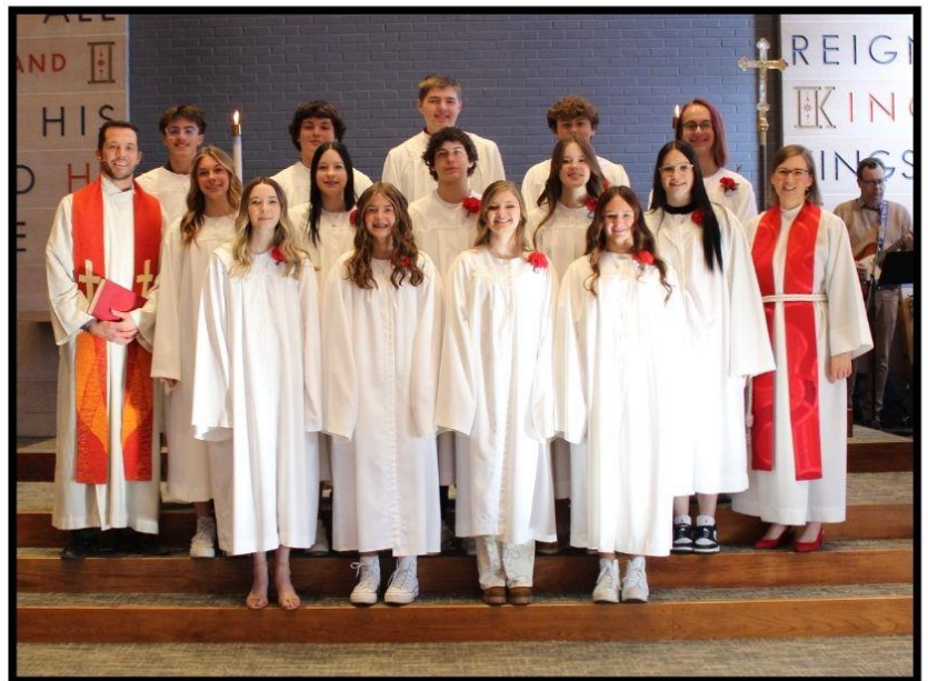
2024 AFFIRMATION OF BAPTISM CLASS