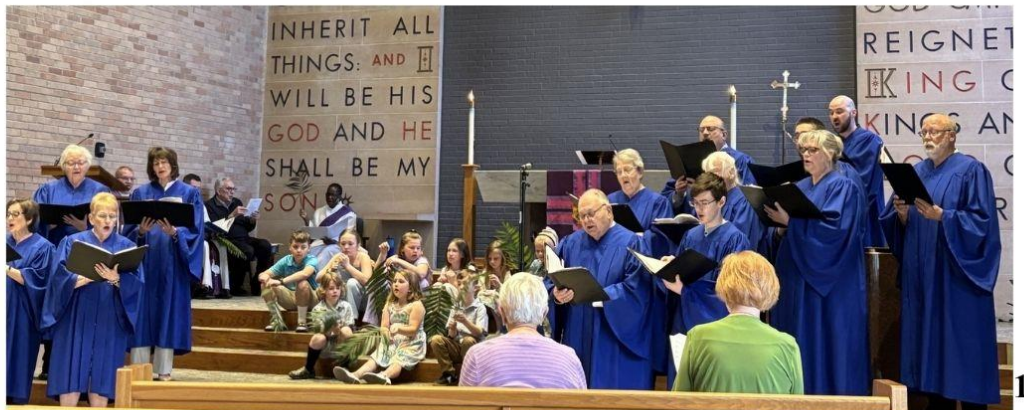
Right: the Sanctuary Choir along with the Children's Choir Palm Sunday Choir provided special music on Palm Sunday at both services