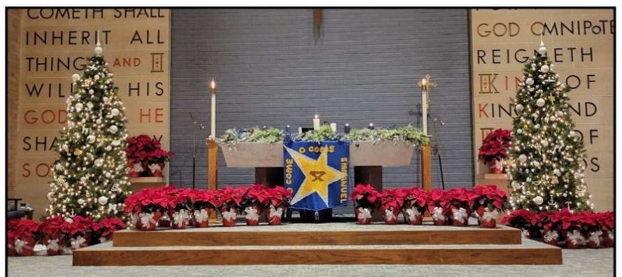
The front of the sanctuary decorated for Christmas