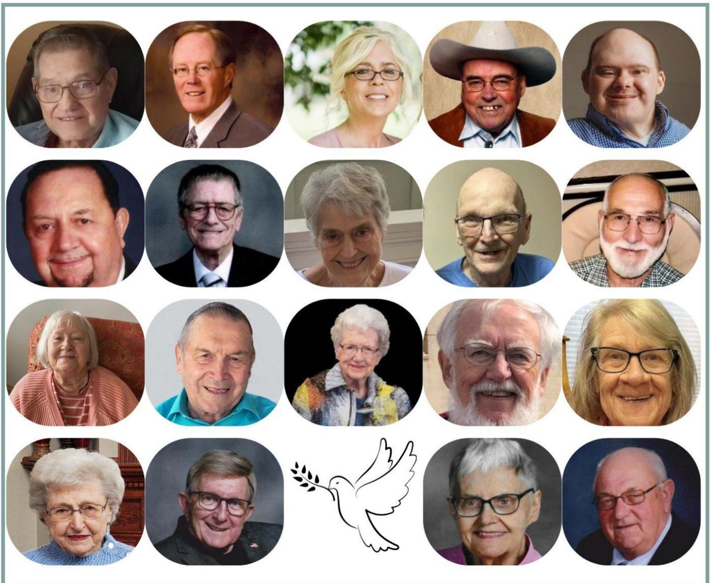
Pictured in same order as listed above, across, then down

Therefore: Be it resolved that we commend our siblings in Christ to the eternal care of a gracious and loving God.