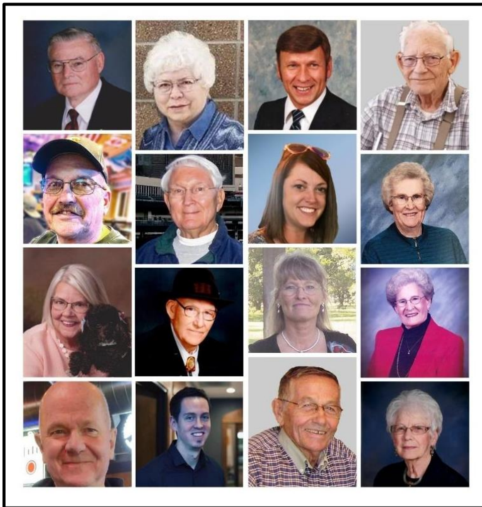
Pictured in same order across, then down, as list above

Therefore: Be it resolved that we commend our brothers and sisters to the loving care of a gracious and loving God.