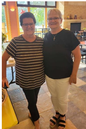
Bottom Row: The wonderful volunteers who make the tasty soups offered for lunch; Jeanne's retirement celebration