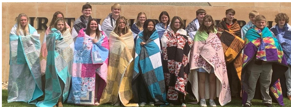
Quilters gift high school seniors a quilt at graduation

The First Lutheran Church Quilters are most appreciative of the fabric items and monetary donations that members of our church and community have provided to us for the many projects that have been completed throughout the year. Thank you to all that have assisted us in many ways. We have been blessed!