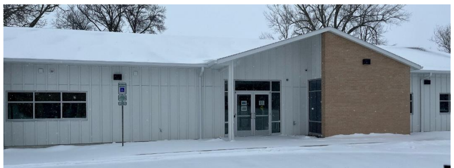
The raised garden bed and the food security building built within the last year on the north side of our property.