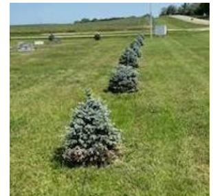
Photos of the newly planted trees and the spring clean-up crew