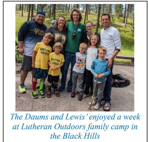
The Daums and Lewis' enjoyed a week at Lutheran Outdoors family camp in the Black Hills