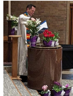
The Altar and Baptismal Font decorated with flowers for Easter morning.