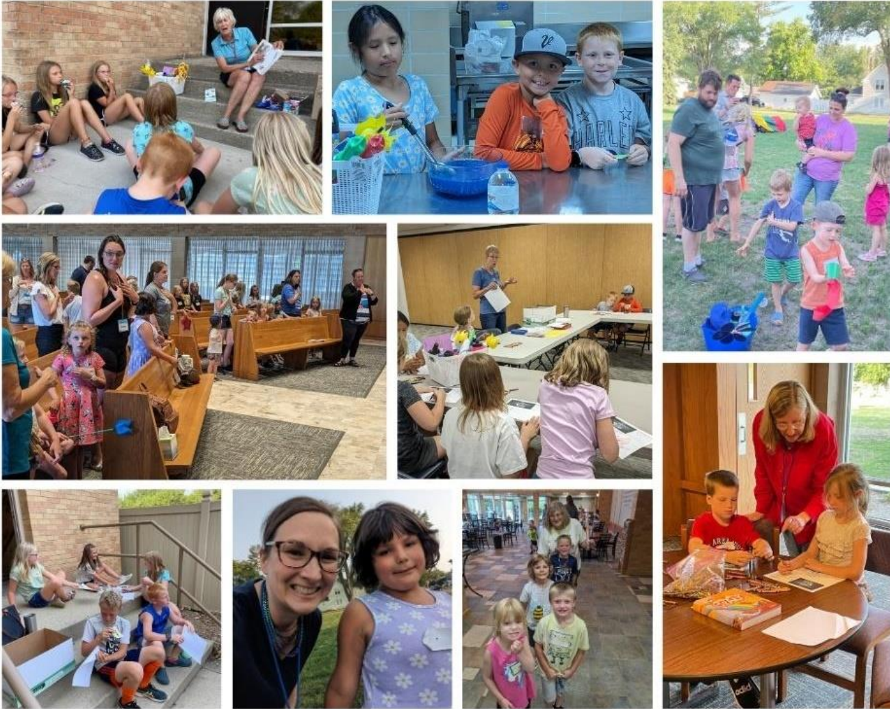
Kids and adults alike enjoying VBS 2023 – “How to Train Your Emotions”