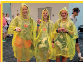
Quotes are from speakers at the Gathering