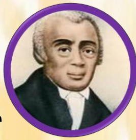
Bishop Richard Allen