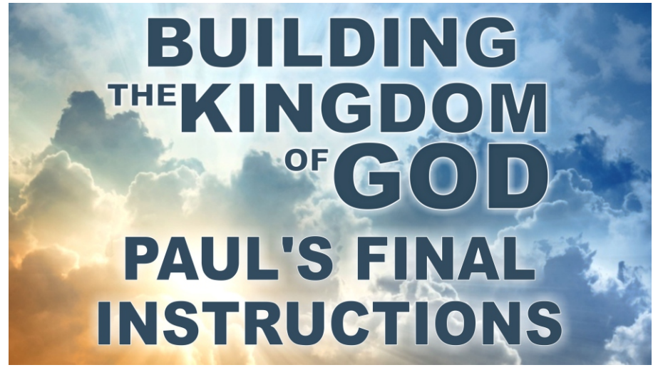
PAUL'S FINAL INSTRUCTIONS