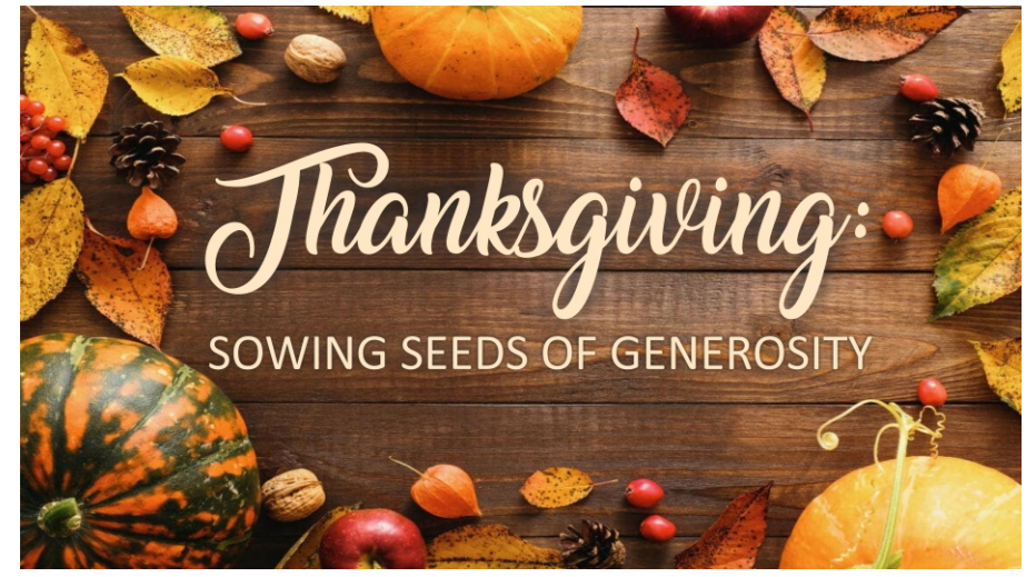
THANKSGIVING: SOWING SEEDS OF GENEROSITY "...A farmer went out to sow his seed." Matthew 13:3 (NIV)