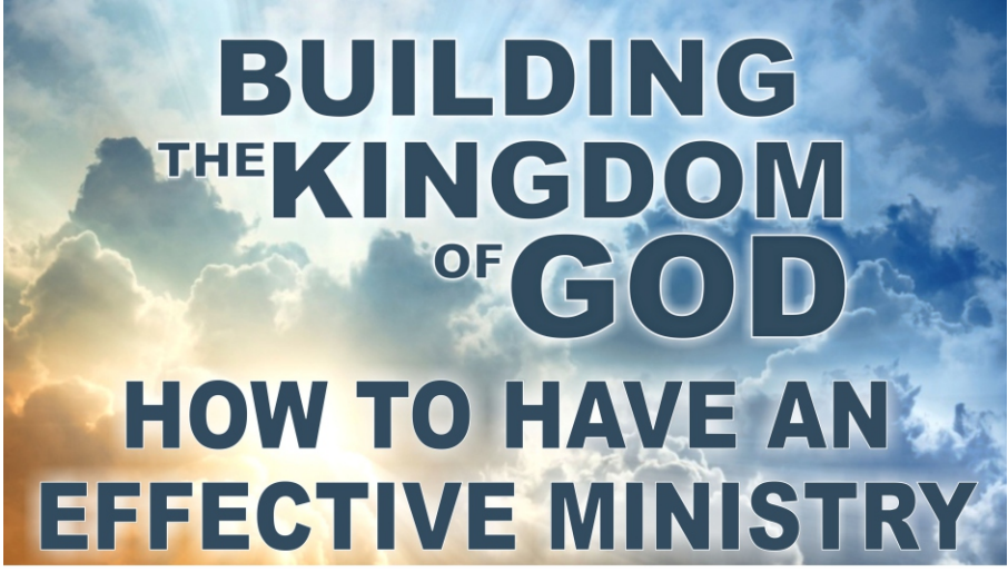
HOW TO HAVE AN EFFECTIVE MINISTRY