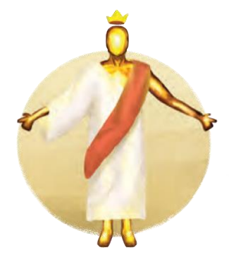
Body (1 Corinthians 12:12)