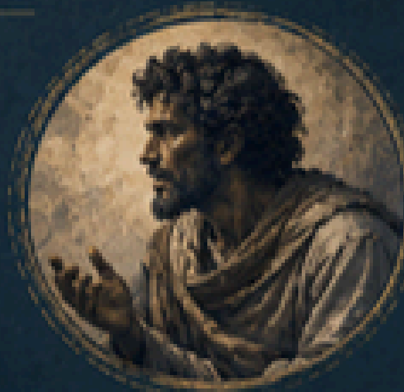
ZOPHAR THE NAAMATHITE

Asserts God's justice and reminds Job of human frailty and deserving judgment.