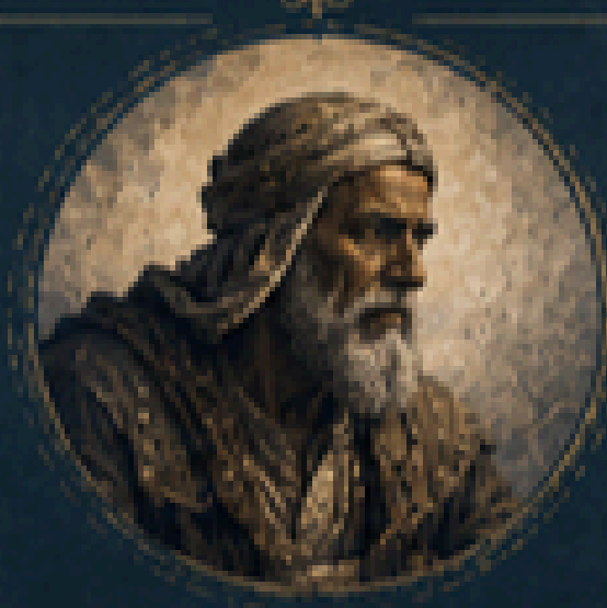
BILDAD THE SHUHITE

Believes suffering is always the result of sin and calls Job to repentance.