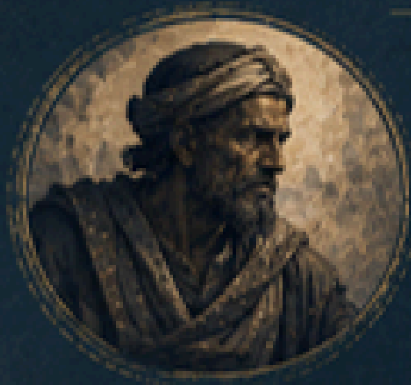
ELIPHAZ THE TEMANITE

Believes suffering is always the result of sin and calls Job to repentance.