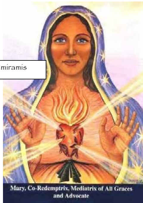
Mary, Co-Redemptrix, Mediatrix of All Graces and Advocate