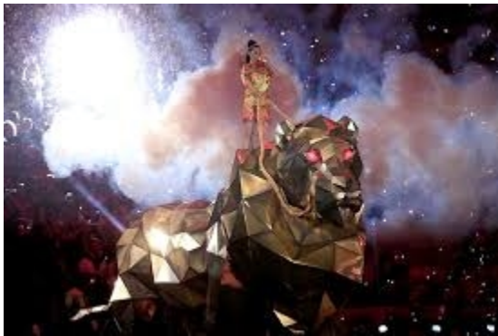
Katie Perry at Superbowl 2014

I saw Religious Rome embracing and empowering all forms of Satan-inspired, man-made religions and religious practices working together with the Anti-Christ to deceive the world through a devilish and perverse doctrines of "tolerance" during the first 3½ years of Tribulation as both profited from the partnership. The Beast was dressed in purple as a King and has 10 Kings waiting for a Kingdom that he will give to them after he uses this Apostate Church to attain power for the first 3 ½ years of the Tribulation. The Vatican and its citizens were also arrayed in scarlet as the colors of a kingdom. Competition is unavoidable as the Beast [Anti-Christ will demand worship]