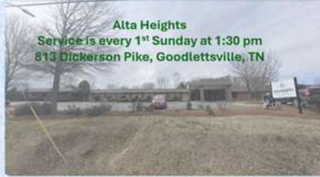
Alta Heights Service is every 1 st Sunday at 1:30 pm 813 Dickerson Pike, Goodlettsville, TN