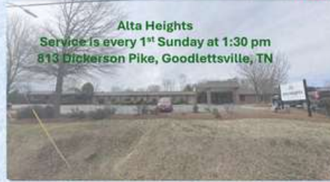
Alta Heights Service is every 1 st Sunday at 1:30 pm 813 Dickerson Pike, Goodlettsville, TN