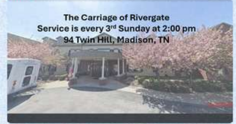
The Carriage of Rivergate Service is every 3 rd Sunday at 2:00 pm 94 Twin Hill, Madison, TN