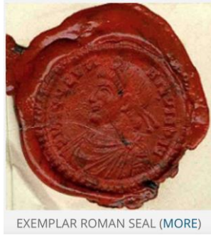
EXEMPLAR ROMAN SEAL (MORE)

oh...the seal of the Roman centurion in charge from his own signet ring would have literally sealed the deal!