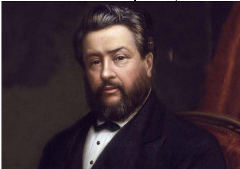
Charles Haddon Spurgeon (1834-1892), the amazing British pastor known as the "Prince of

We want our children to grow in knowledge and discernment...so that can know what is excellent and be filled with righteousness which will bring glory and praise to God. You see, one of the biggest issues we have in our day is the lack of good decision making. We've got to teach our children how to make godly decisions. See the screens: One of my favorite preachers of all time is this man: